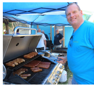
BBQ Benefit for Southeast Florida Honor Flight