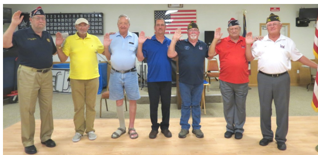
VFW & VFW AUXILIARY OFFICER INSTALLATION